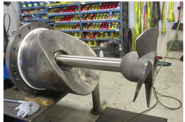
Figure 2: Axial Flow Pump Rotating Assembly

In a high-output paper manufacturing plant, productivity is critical to the bottom line. The last thing anyone wants is a series of plant-halting pump failures or heightened injury risks. Challenges like seal and bearing failures, broken shafts and pump failure - can cause operations to come to a standstill. It's not sustainable. It's not profitable. It's enough to give any paper mill maintenance manager a headache, especially in a critical application process such as chlorine generation.