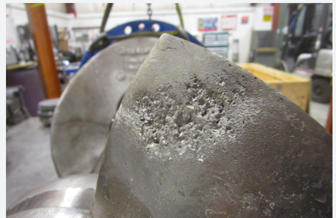
Figure 4: Propeller Cavitation Damage

Due to the complexity of renewing the clearance between the propeller and elbow, the GPM team started at the bearings on the other end of the shaft and worked their way out. The team increased the bearing journal shaft OD by 0.0009" to 0.0017", which increased bearing life significantly. This modification was also conducted on all three rotating assemblies. When the eventual new elbow was installed, this major change out also helped correct several additional factors, including the footing and base mounting of the pump within the system. Another critical clearance adjustment brought back the propeller running clearances to OEM spec, which helped reduce cavitation.